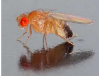
Our Beloved Mascot

Whoa, slow down cowboy. Seventy-seven thousand new churches?